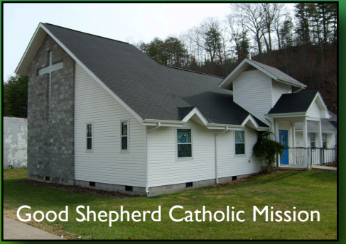
Good Shepherd Catholic Mission

Appalachia Summer Mission in Wolfe County, KY July 10-15, 2018